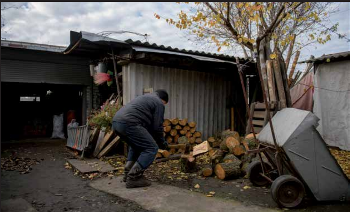
↑ An older man chopping wood because his home has no electricity or heating in Kharkiv region, Ukraine.