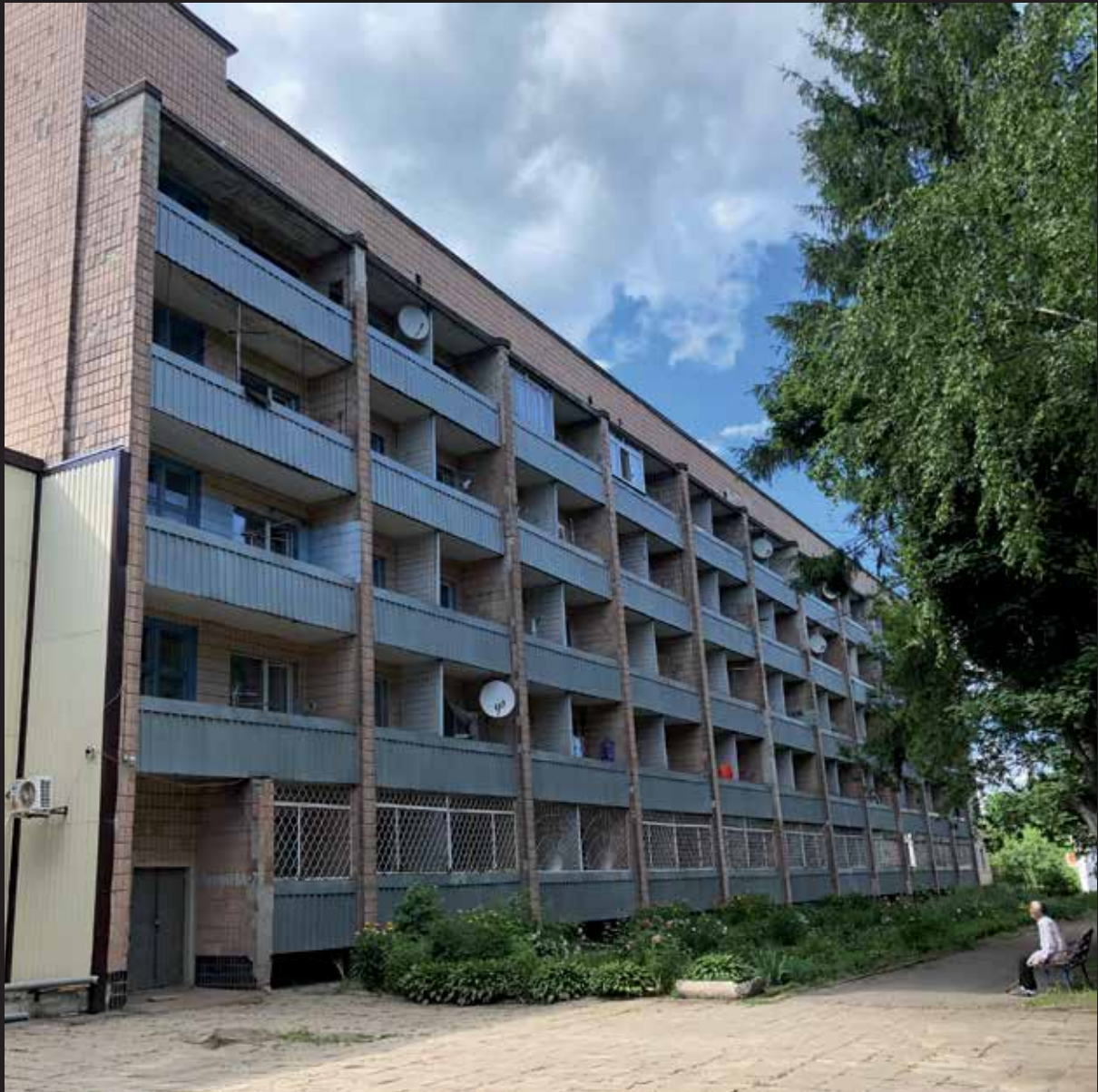
↑ An institution for older people in Ukraine