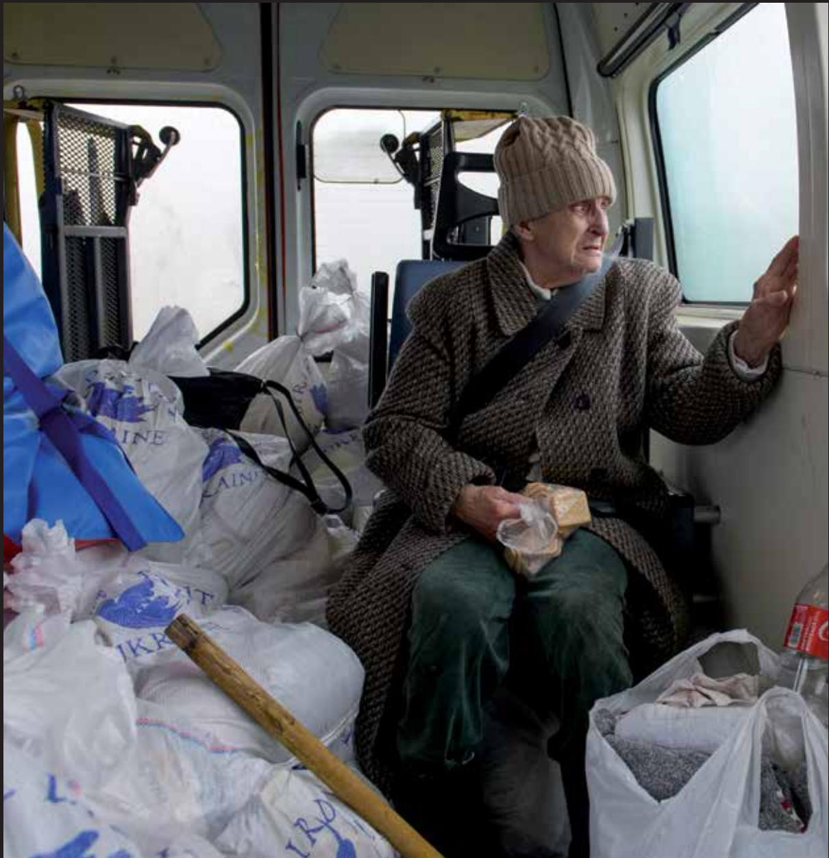
↑ An older woman with a disability being evacuated in Kharkiv region, Ukraine.