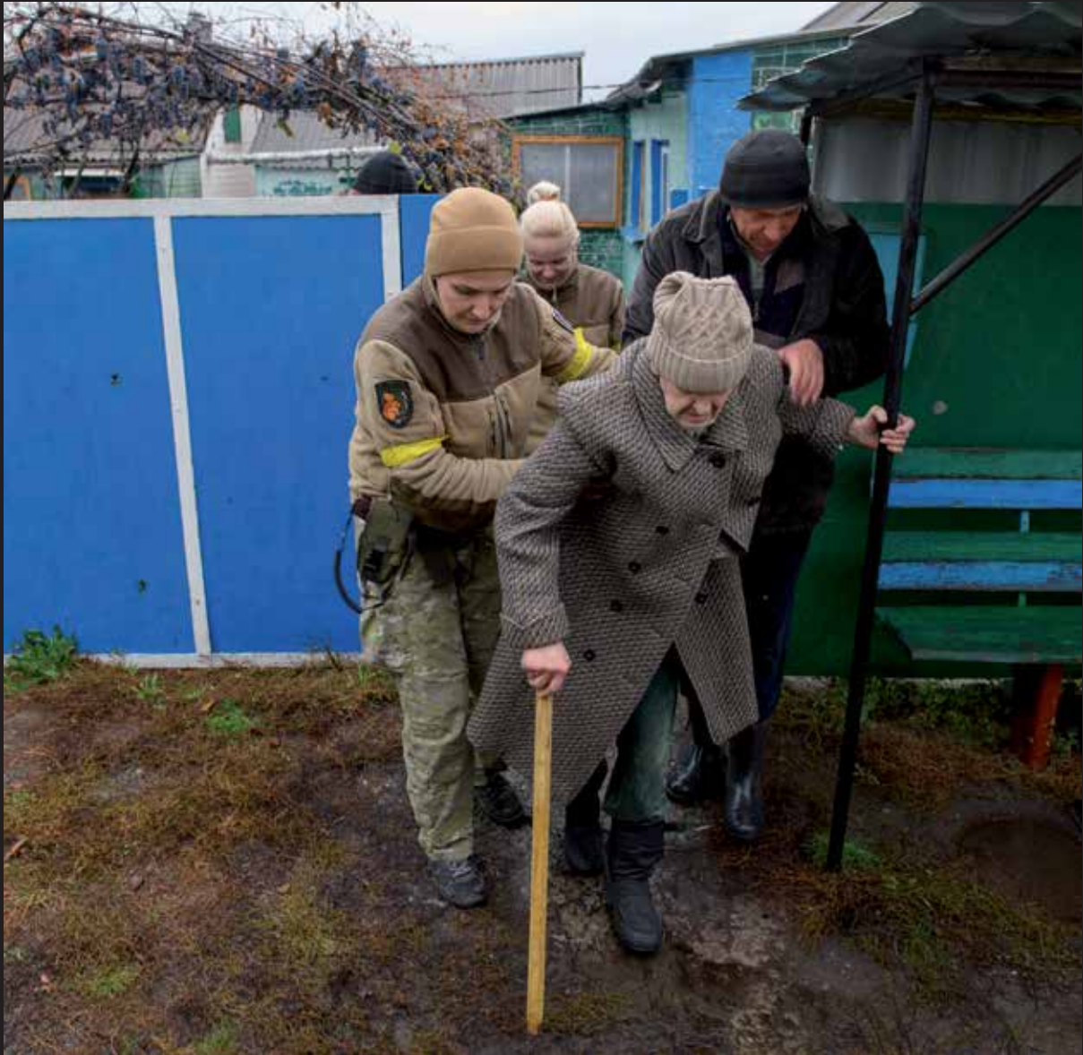
↑ An older woman with a disability being evacuated in Kharkiv region, Ukraine.