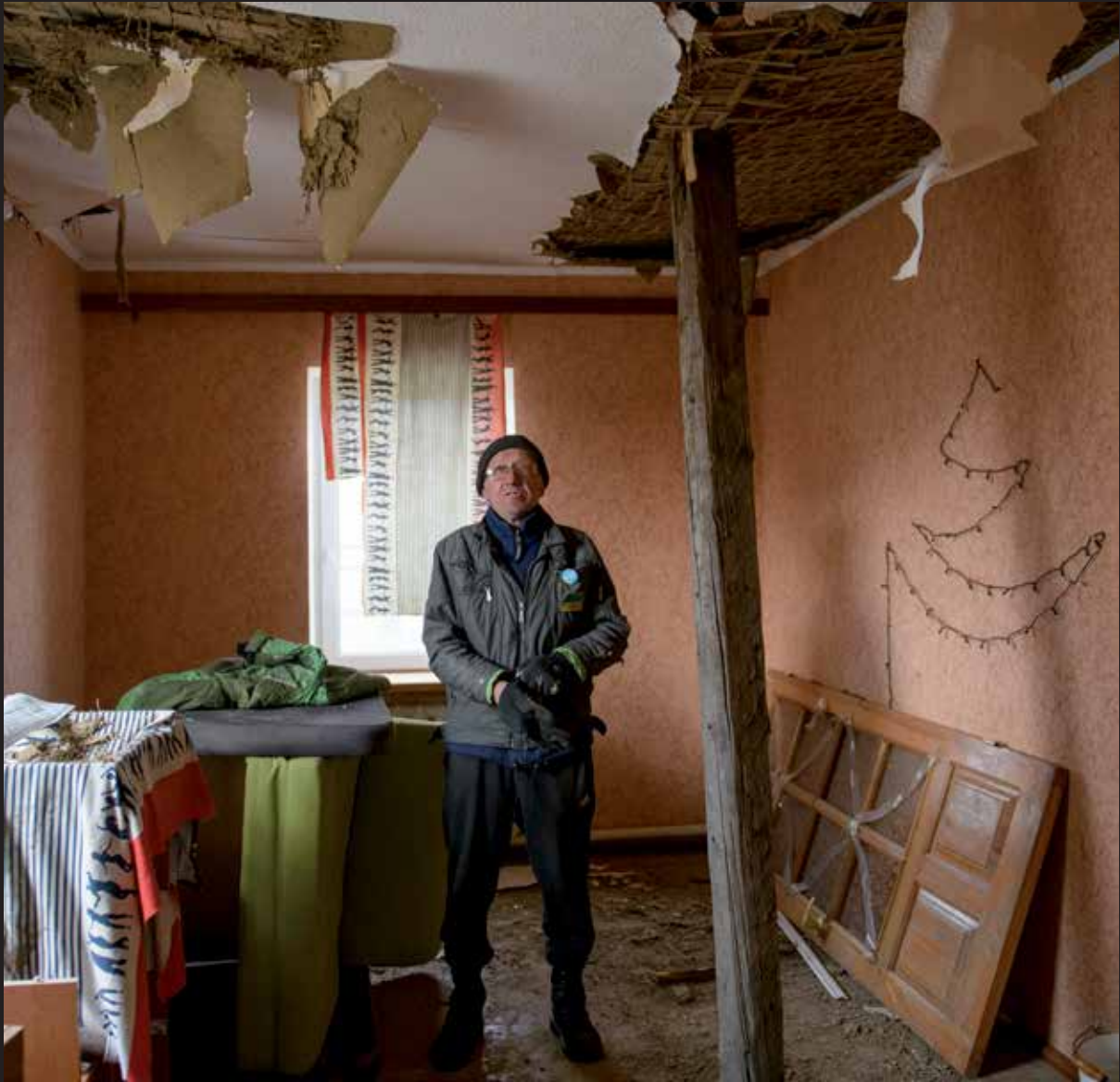
↑ An older man in his home that was damaged by attacks in Kharkiv region, Ukraine.